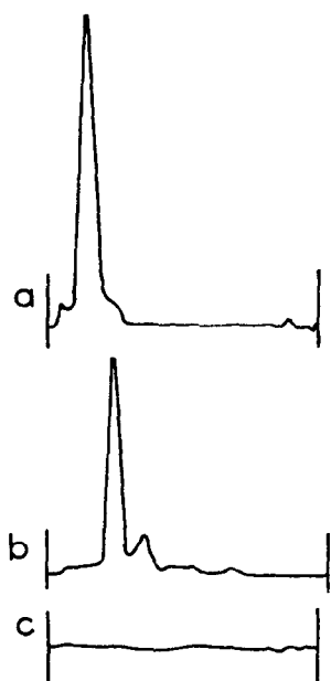
Fig. 1. Densitograms of the preparations of 13S globulin before and after hydrolysis with proteases from dry seeds and growing seedlings after native electrophoresis. (a) 13S globulin from dry seeds; (b) 13S globulin after treatment with the metalloproteinase; (c) 13S globulin after successive treatment with the metalloproteinase and the preparation of cysteine proteinase and carboxypeptidase.